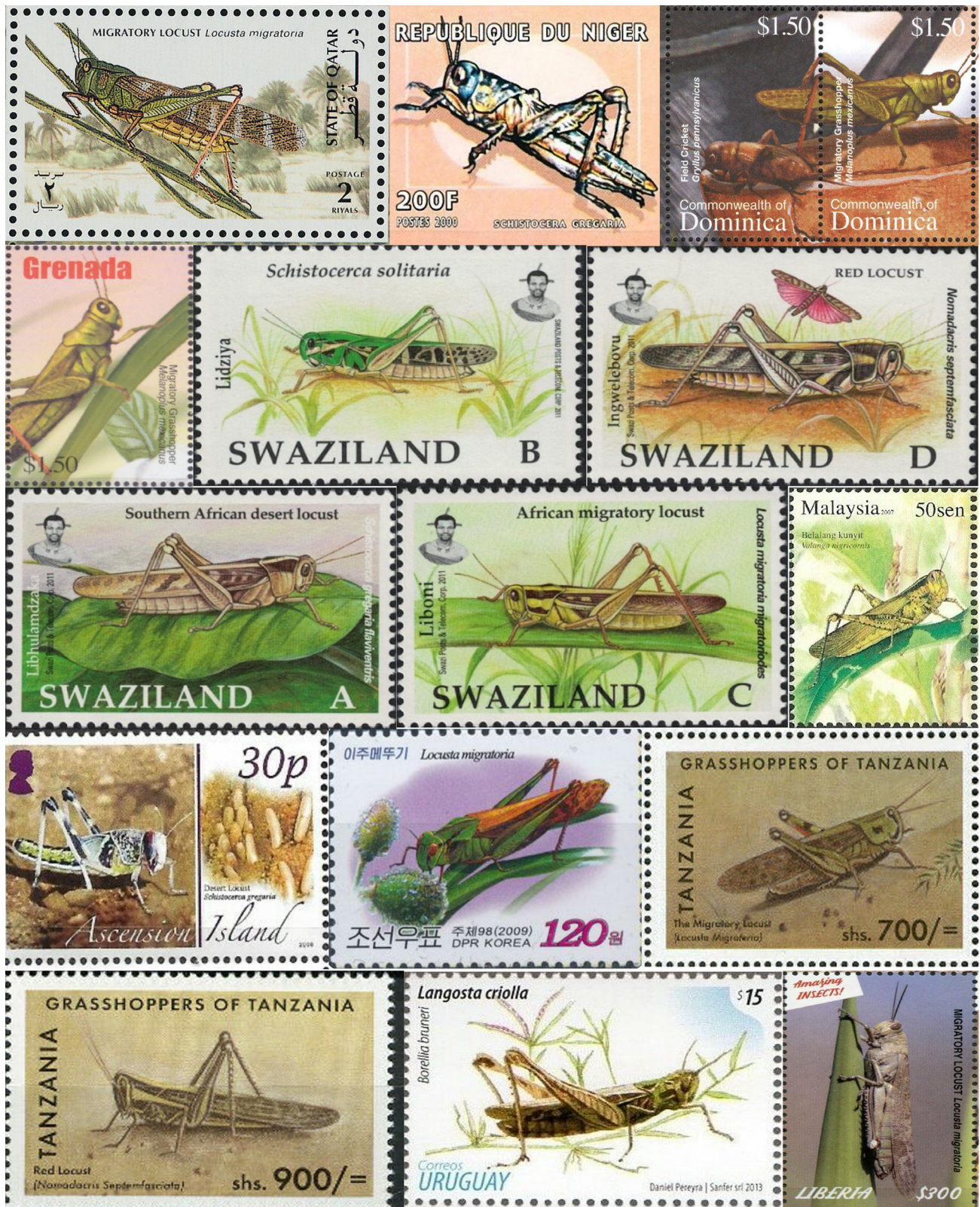
Figure 3. Stamps from Qatar (1998) to Liberia (2019).