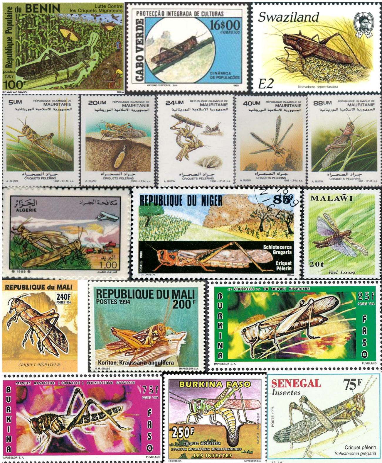
Figure 2. Stamps from Benin (1987) to Senegal (1996).