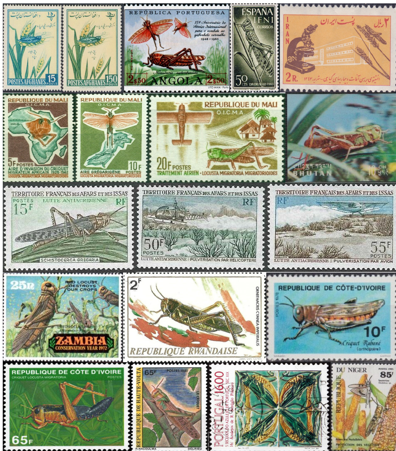
Figure 1. Stamps from Afghanistan (1961) to Niger (1985).