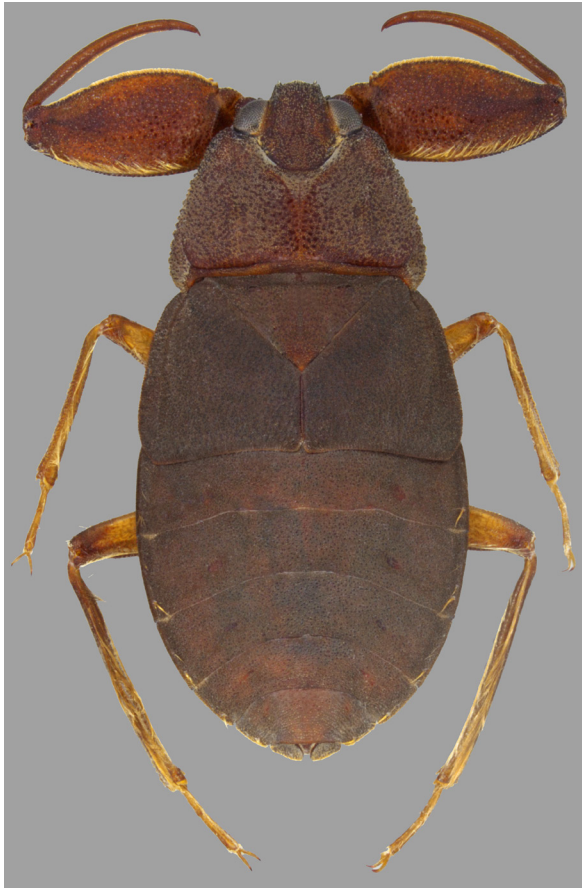
Figure 5. Brachypterous female of Cryphocricos hungerfordi (Altotonga, Veracruz).

it from the Old World and South American species. Later, the subgenus Interocoris was elevated to full generic status (Polhemus and Polhemus 2008b). A more detailed taxonomic study is needed to address the classification of this monotypic taxon and related taxa. The genus Ctenipocoris Montandon, also a member of Laccocorinae, is represented in the Neotropics by six species. Five of those are distributed in South America and only one species has been reported as far north as Costa Rica (Herrera 2013). This genus has at least one representative in Mexico; we have examined specimens collected in the southern states of Chiapas and Yucatán. Our understanding of the taxonomy of this genus is poor and the available literature is not sufficient to enable confident identification of the specimens from Mexico.