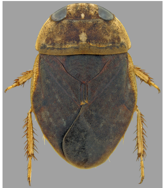
Figure 7. Male of Interocoris mexicanus (Motozintla, Chiapas).