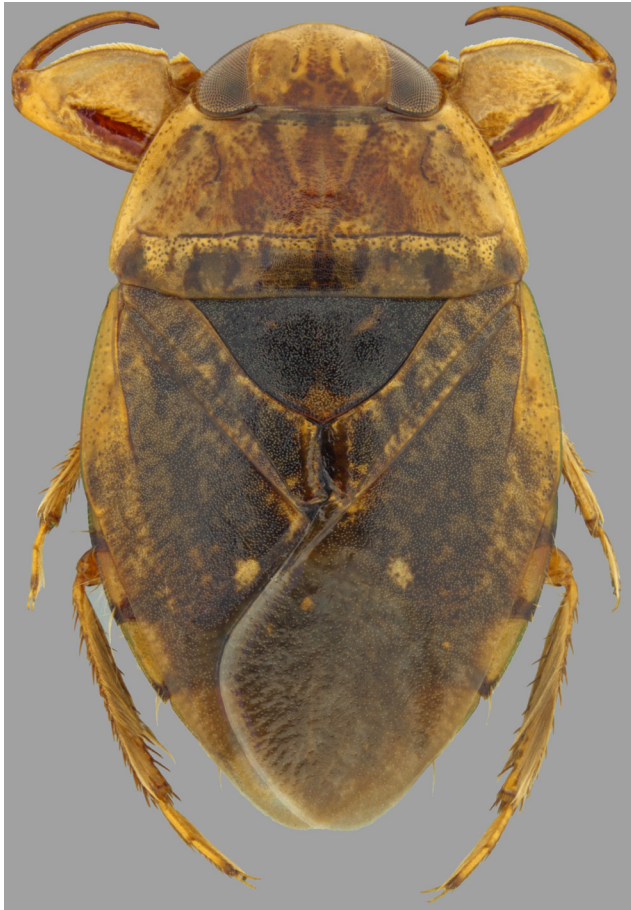
Figure 8. Female of Pelocoris biimpressus (Los Sabinos, Michoacán).