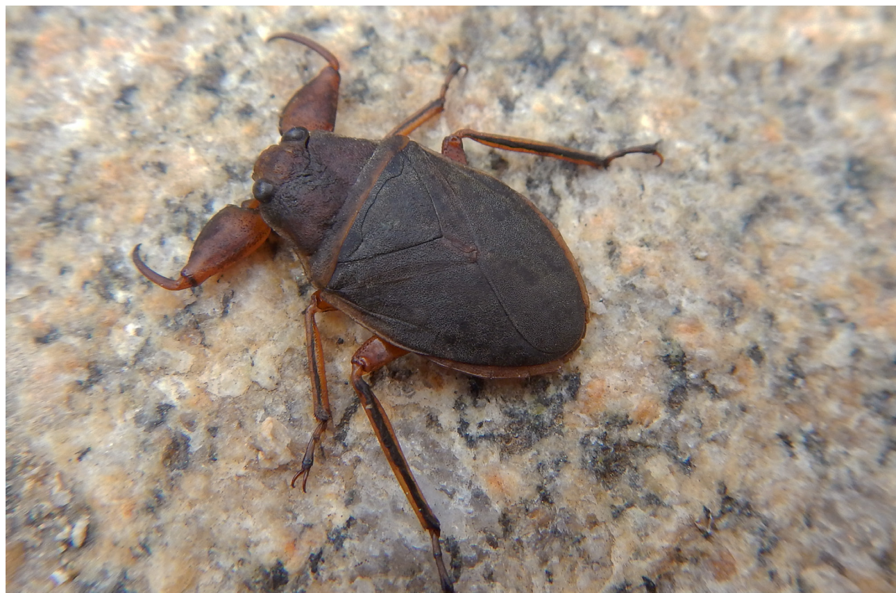
Figure 4. Staged specimen of Cataractocoris macrocephalus (Río Rana, Oaxaca).

The subfamily Laccocorinae is the third most species-rich subfamily and in Mexico it is represented only by the monotypic genus Interocoris La Rivers. Interocoris mexicanus (Usinger) (Fig. 7) was originally described in the genus Heleocoris Stål (Usinger 1935) and was placed in the subgenus Interocoris by La Rivers (1974) to distinguish