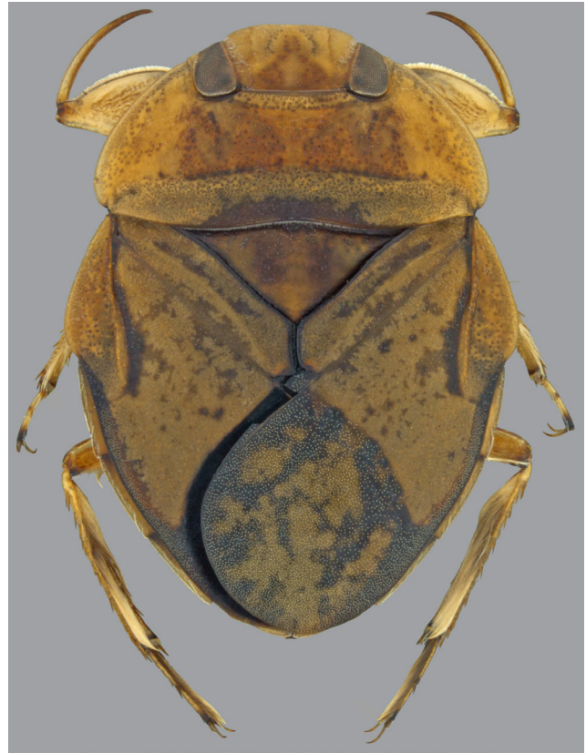
Figure 6. Male of Limnocoris signoreti (Putla de Guerrero, Oaxaca) (det. H.D.D. Rodrigues).

The subfamily Naucorinae, with 11 genera and 80 described species worldwide, is represented in the New World by two genera, one of which occurs in Mexico. Pelocoris Stål is most diverse in South America and has been revised for the United States and Canada (Polhemus and Sites 1995, Sites and Polhemus 1995, Sites 2015); however, the fauna of Mexico is uncertain. Currently, two species of Pelocoris have been recorded in Mexico, Pelocoris biimpressus Montandon (Fig. 8) and P. femoratus (Palisot de Beauvois), and we have seen at least one undescribed species in museums. Of these, Pelocoris biimpressus is the most common and is widespread. Pelocoris femoratus is common throughout the eastern United States and Canada