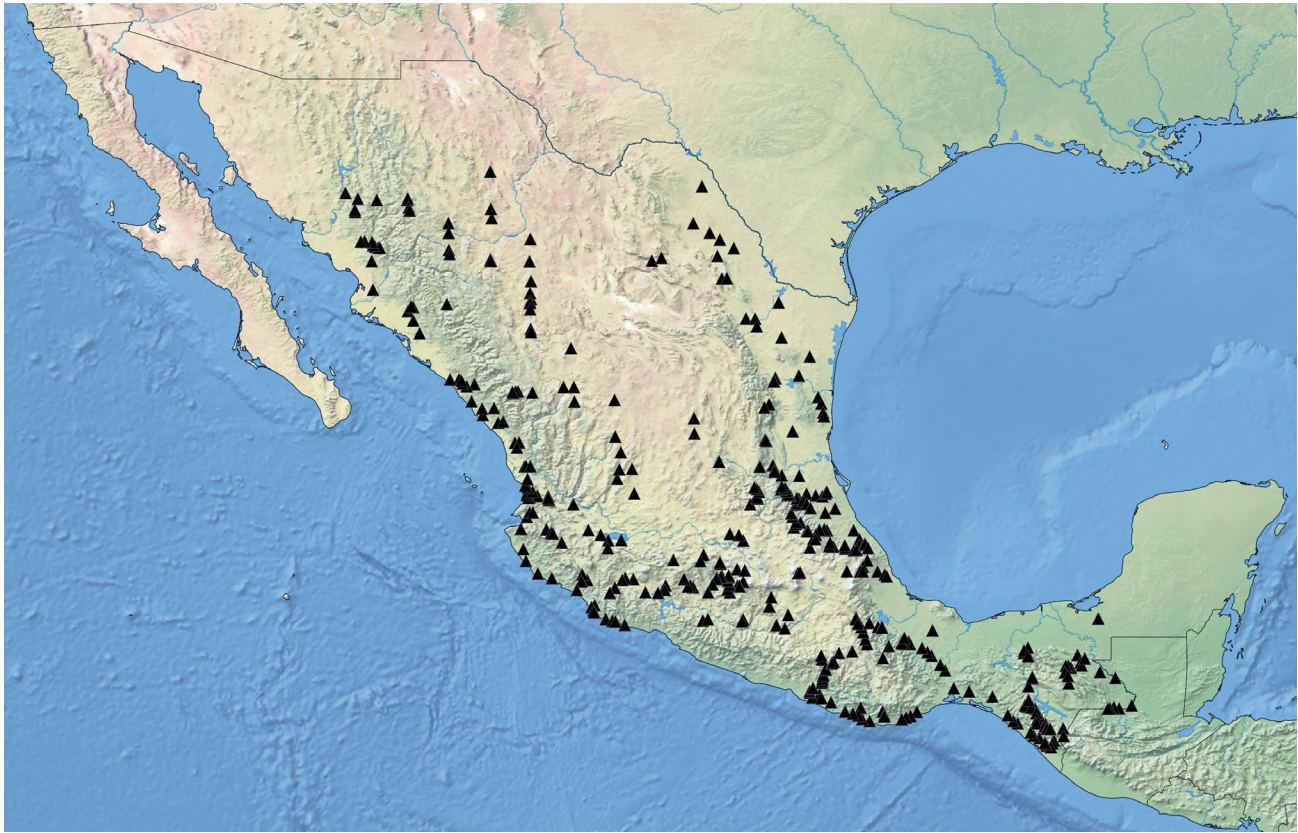
Figure 3. The 432 localities where we collected samples for the project on the Mexican fauna of Naucoridae.

but three of Mexico's biogeographic provinces (Morrone 2005). We did not collect in the two provinces in the Baja California Peninsula because of the low overall species richness of the area and because that fauna was well represented in collections from the western United States. We also did not collect in Yucatan Peninsula province due to the small number of surficial waters. Photographs of the collection sites identified as L-numbers are available in a Locality Image Database via a link from the internet site of the Enns Entomology Museum, University of Missouri.