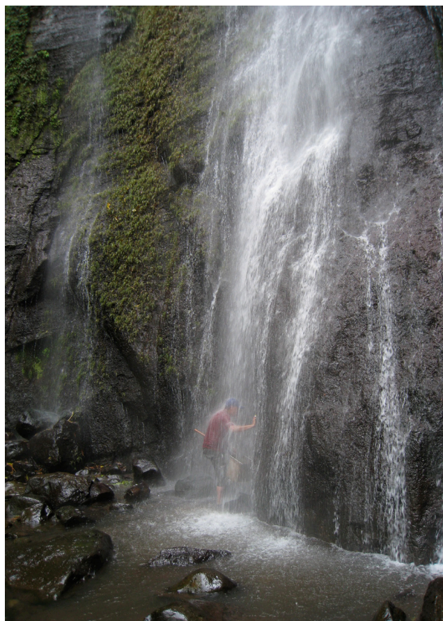
Figure 2. DRV collecting specimens of the genus Cataractocoris at El Arcoiris waterfall in Veracruz, Mexico.