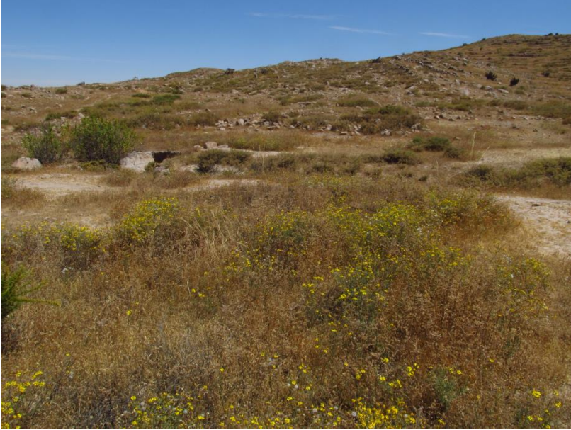
Figure 5. Thorny scrub vegetation at Ilubaya, 2 863 m (Moquegua, Peru).