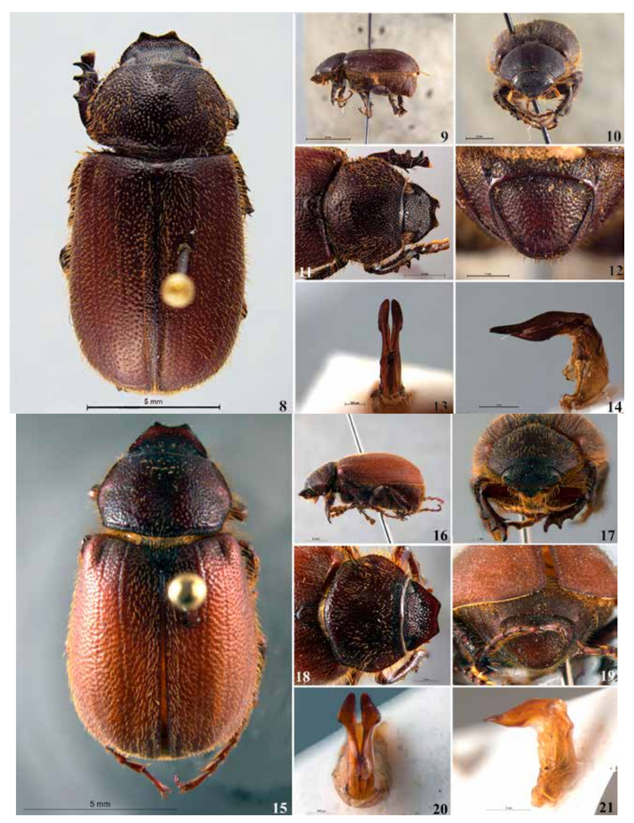
Figures 8-14. Liogenys hirtipennis Frey: (8) dorsal view (9) lateral view, (10) frontal view (11) clypeus and pronotum, dorsal view (12) pygidium. Male genitalia, parameres (13) dorsal view, (14) lateral view. Scale: Figs. 8-9 = 5mm, Figs. 10-11 = 2mm, Figs. 12-13 = 1mm, Fig. 14 = 500 \mu m. 15-21. Liogenys moroni new species. (15) dorsal view (16) lateral view, (17) frontal view (18) clypeus and pronotum, dorsal view (19) pygidium. Male genitalia, parameres (20) dorsal view, (21) lateral view. Scale: Fig. 15 = 5mm, Fig. 16 = 2mm, Figs. 17-19, 21 = 1mm, Fig. 20 = 500 \mu m.